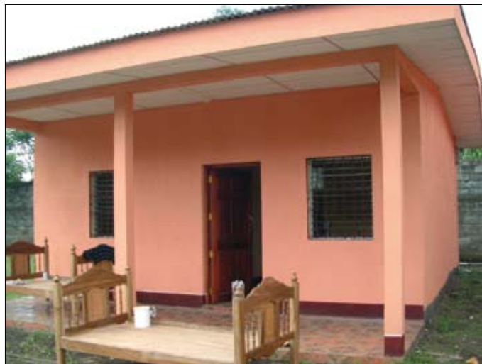
One of the dormitories in Nicaragua.