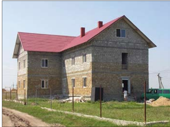
Construction of Seminary and Mission Centre in Ukraine – Current project supported since 2003

“Great is Thy faithfulness... Morning by morning new mercies I see” we sing in the old Gospel hymn. How fitting are those words when we think of God's blessings upon the work of CLMS! Fresh from His abundant goodness last year, we once again look forward to new opportunities and new challenges. At the same time, we are confident that God will continue to provide new partners in carrying out the Lord's mission. Elsewhere in this Mission Advocate you can read about how generously God has blessed us this past year, and what our hopes are for the future. But the mission society can accomplish nothing