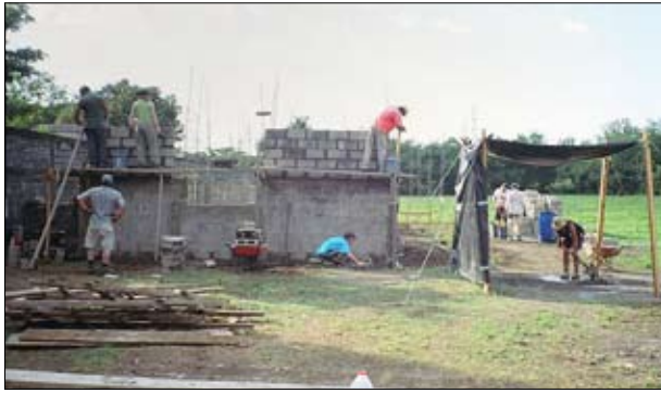
Hands-on mission in Chinandega, Nicaragua, December 2006. Workers from Faith, Grand Prairie, Good Shepherd, Valleyview and Redeemer, High Prairie worked on two dormitories. $23,000 was raised by the above congregations and St. John's, Wembley to fund the construction.

The answer to that question will not be determined by statistical reports, but by the One who undertook the ultimate hands-on mission, our Lord Jesus Christ. Talk about cross-cultural ministry! The eternal and omnipresent Son of God, assumed human flesh in the womb of a virgin. The Creator of and Ruler over things in heaven and earth took on the form of a servant. The holy and sinless One took on our sin and became the vilest of sinners in